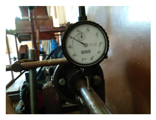
Fig.3.Checking Linearity of Shaft